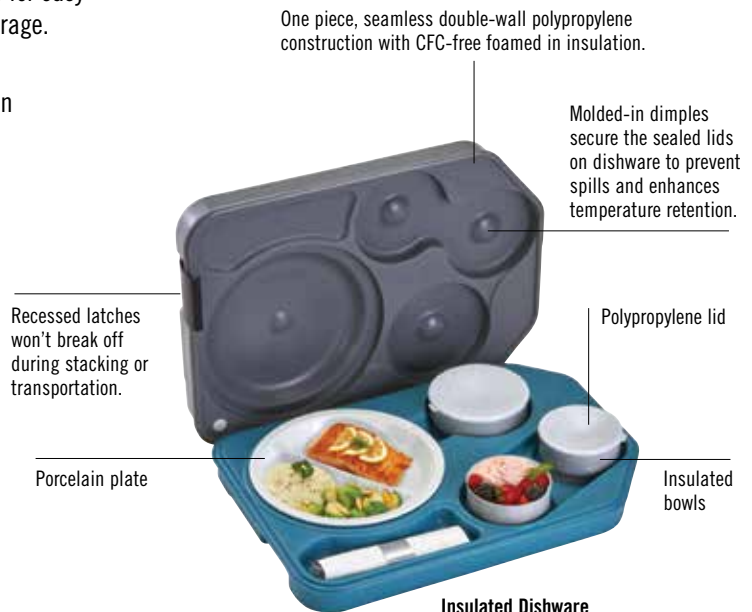
Insulated Dishware ITPD3753TH