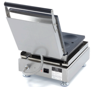
Easy to clean