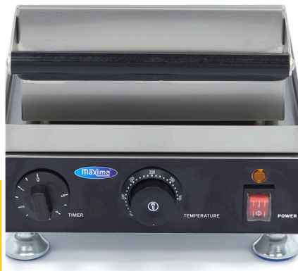
Robust and easy to operate