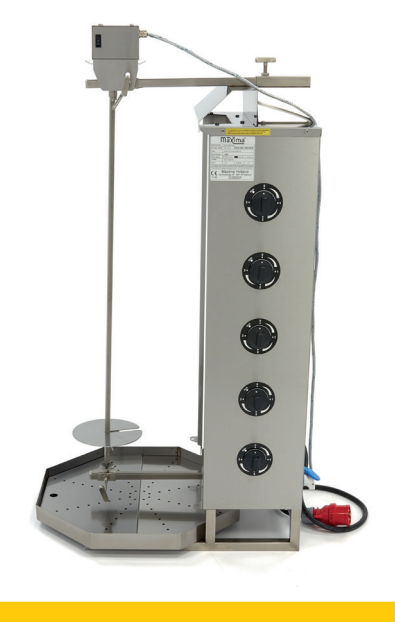
With adjustable skewer for perfect preparation.