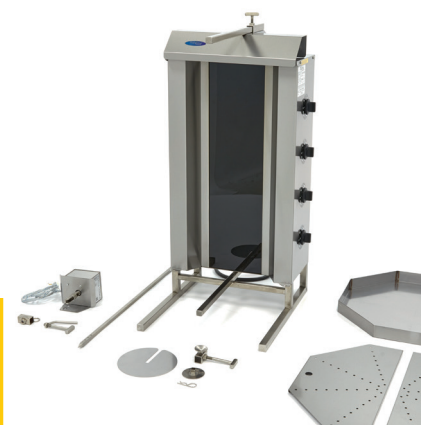
Easy to dismantle and clean