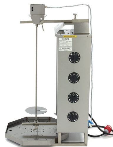
With adjustable skewer for perfect preparation.