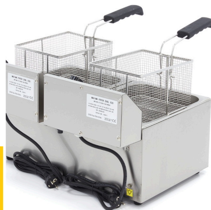
Completely made of stainless steel