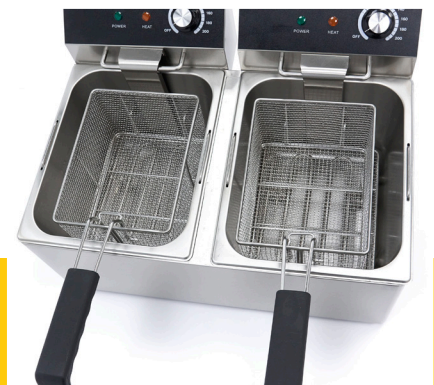
Protected heating elements and adjustable thermostat