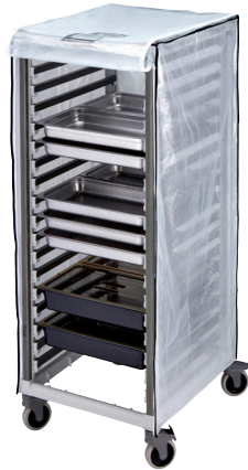
GBCTUGNPR21 Optional Heavy Duty Vinyl Cover for GN 2/1 Full Size Trolley.