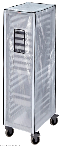
GBCTUGNPR11 Optional Heavy Duty Vinyl Cover for GN 1/1 Full Size Trolley.